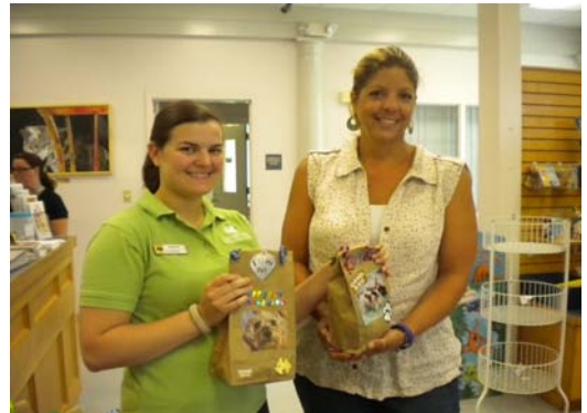
Dog Bags Donated to the Bangor Humane Society