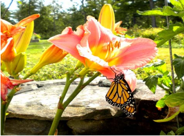
Wiggles The Butterfly