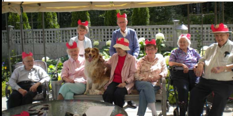
Arbor's Lobster Festival