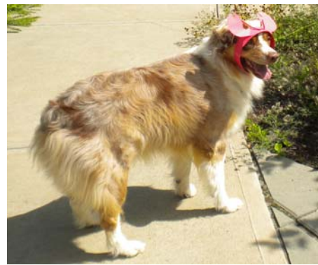
Jesse The Lobster Dog