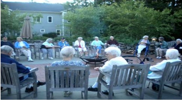
Hot Dog Roast Campfire