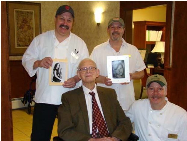
Ham Scholarship— Fathers of Recipients