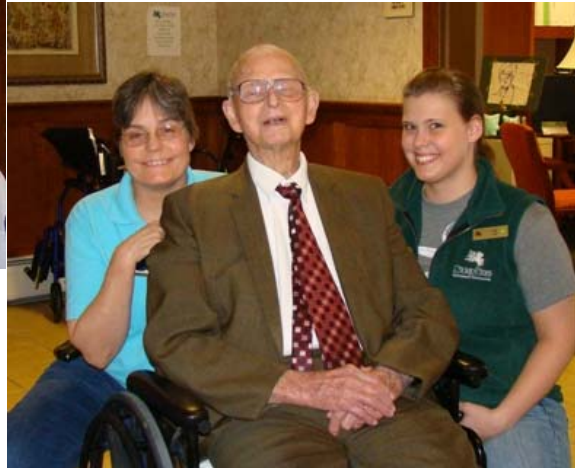
Ham Scholarship Recipients