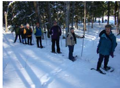
DPI snowshoe group