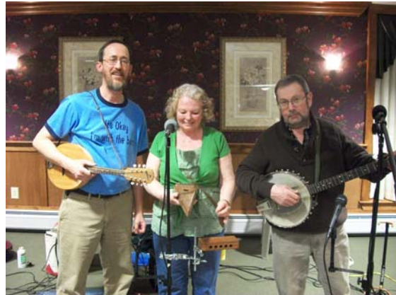
Spirited Folk Group in Concert