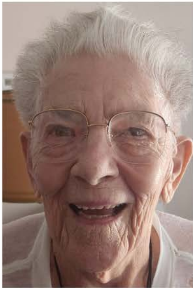
R U B Y