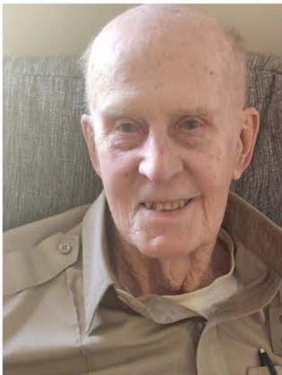
B i l l