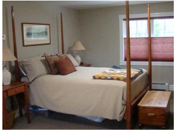
Loft Guest Room