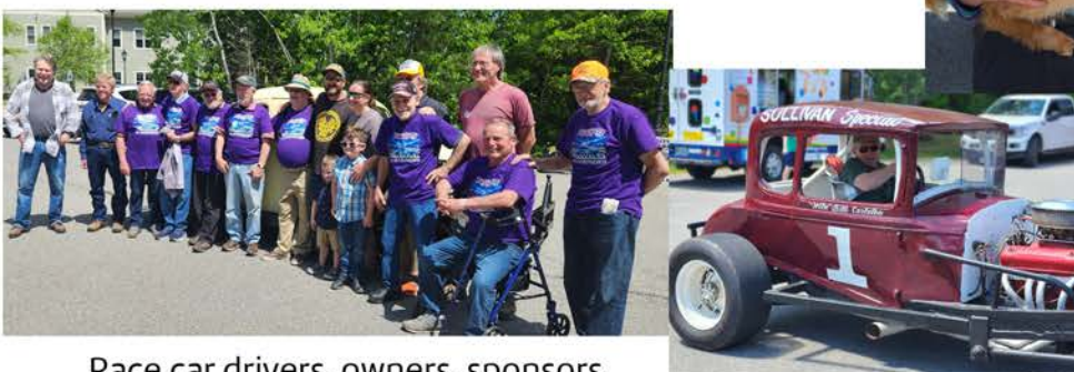
Race car drivers, owners, sponsors.

Thank you to all who came and participated in the fun!